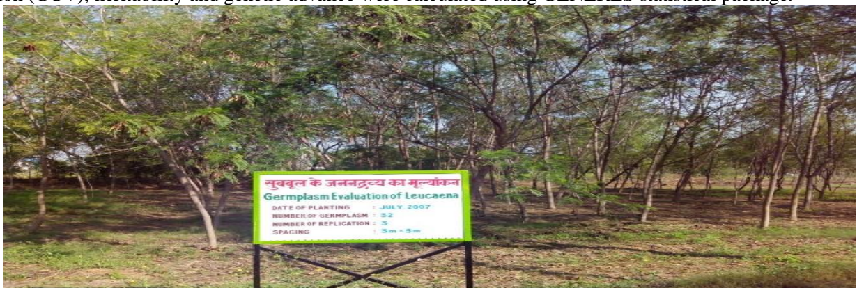
Fig 1: Germplasm evaluation of Leucaena at CAFRI, Jhansi

Leucaena research was extensively carried out by Indian Grassland and Fodder Research Institute (IGFRI), Jhansi, where germplasms were evaluated and selection were carried out for characters such as biomass yield, psyllid resistant, forage quality and quantity. Later a field evaluation trial was carried out at experimental farm of ICAR-CAFRI, Jhansi. For the trial, twenty five germplasm of Leucaena were collected from IGFRI, Jhansi. The germplasm consisted of five species namely Leucaena diversifolia , L. shannoni , L. lanceolata , L. collinsii and L. leucocephala and one hybrid ( L. shannoni x L. leucocephala ). Seedling of different germplasms were planted at 3 x 3m spacing with three replications during 2007-2008. At the age of nine years all these accessions were recorded for tree height and diameter at breast height (dbh). For estimating tree biomass and volume, published equations were used. In the case of Leucaena , timber weight ( W = (339.913 * D^2h) - 15.513 kg/tree) and volume per tree ( V = (0.345714 * D^2h) - 0.0157482 m 3 ) were estimated by using the equations developed by Dhanda et al. 2006. The genetic divergence was estimated by using hierarchical Euclidean cluster analysis (SPSS version 16). The genetic parameters viz., phenotypic coefficient of variation (PCV), genotypic coefficient of variation (GCV), heritability and genetic advance were calculated using GENERES statistical package.